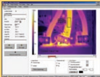
Capture clear thermal images and easily analyze the radiometric (temperature) data for all 19,200 pixels.

Analyze individual images, easily identify hot (or cold) spots and select areas for min., max. and avg. temperature values.