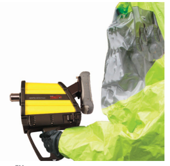
HazMatID Ranger™ – Suspicious substance identification

"You need much wider bandwidth than you might think with these fast rise times," says Valovich. "We are able to see things with the DPO4000 that were previously undetected, which helps tremendously in troubleshooting. The hardest part is figuring out what the problem is. Once you know the problem, fixing it goes quickly."