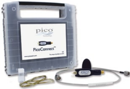
PicoConnect™ 900 Series probe