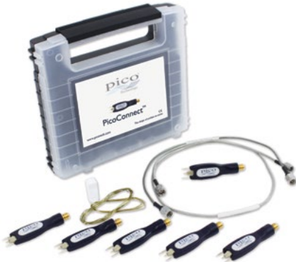
PicoConnect™ 900 Series kit