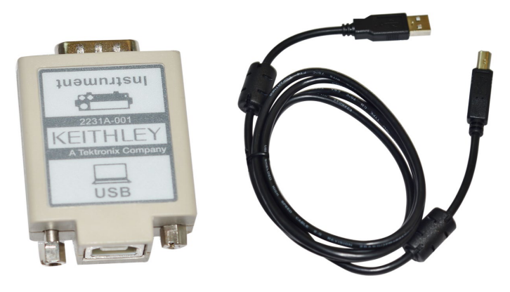
Figure 1: Model 2231A-001 USB Adapter

To set up the remote communication through the Model 2231A-001, configure the computer as follows: