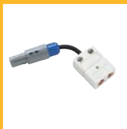
Universal Thermocouple Adapter