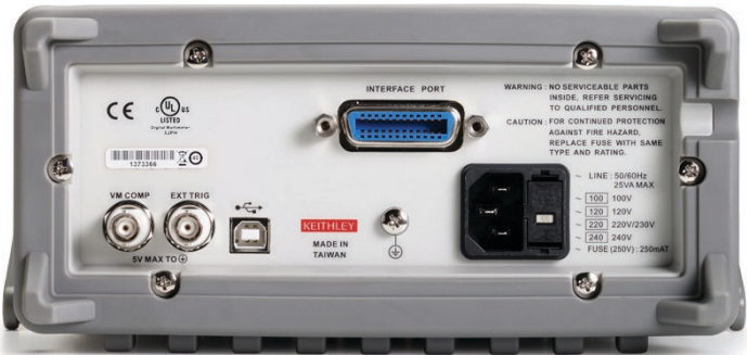
Model 2110 rear panel.

Input bias current: <30pA at 25°C. Input protection: 1000V all ranges (2W input). AC CMRR: 70dB (for 1kΩ unbalance LO lead). Power Supply: 100V/120V/220V/240V. Power Line Frequency: 50/60Hz auto detected. Power Consumption: 25VA max. Digital I/O interface: USB-compatible Type B connection, GPIB (option). Environment: For indoor use only. Operating Temperature: 0° to 40°C. Operating Humidity: Maximum relative humidity 80% for temperature up to 31°C. Storage Temperature: –40° to 70°C. Operating Altitude Up to 2000 m above sea level. Bench Dimensions (with handles and bumpers): 107 mm high × 252.8 mm wide × 305 mm deep (3.49 in. × 9.95 in. × 12.00 in.). Weight: 2.23 kg ( 4.92 lbs.). Safety: Conforms to European Union Low Voltage Directive, EN61010-1. Measurement Cat 1 1000V and CAT II 600V. EMC: Conforms to European Union Directive 89/336/EEC, EN61326-1. Warranty: Three years.