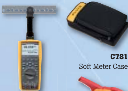
C781 Soft Meter Case