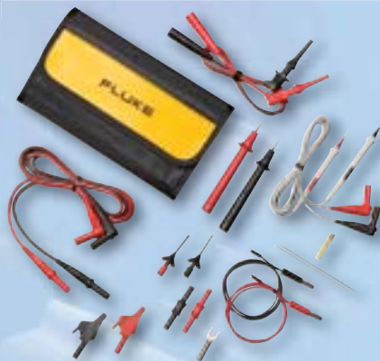
TLK287 Electronic Test Lead Kit