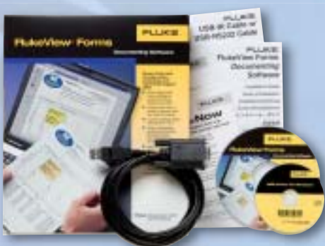
FlukeView ® Forms Software and Cable