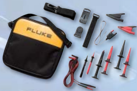
TLK289 Industrial Test Lead Kit

A wide array of accessories are available to help you maximize the productivity of the Fluke 289 and Fluke 287 but the following are essential for most users.