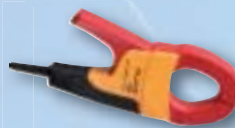
i400 Current Clamp