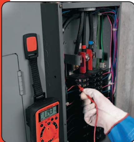
Magne-Grip™ holster frees both hands for work