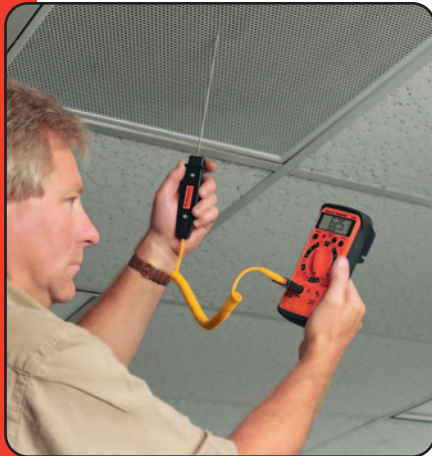
Measures temperature (thermocouple included)