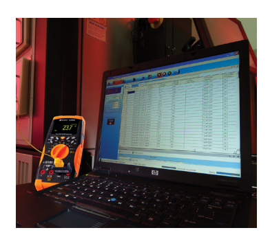
Figure 1. Automate recording of measurements with bundled GUI data-logging software.