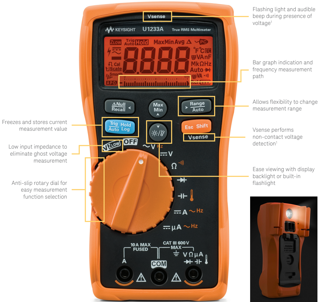
Figure 1. U1230 Series front view