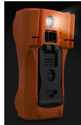
Figure 2. The built-in flashlight as illustrated