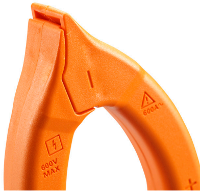
Figure 1. The unique wire separator allows you to separate and measure individual wires more easily

The U1190 Series clamp meters are built to perform in the environments you work. The unique wire separator allows you to effortlessly isolate and perform measurements on individual wires in a bundle. For improved visibility when making measurements, these clamp meters also come with an easily activated built-in LED flashlight that illuminates the test area. These features ensure that you are better equipped when making measurements.