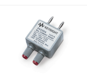
34330A Current Shunt (30 A) (for DMM function)