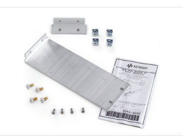
34190A Rack Mount Kit