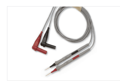
34133A Precision Electronic Test Leads (for DMM function)