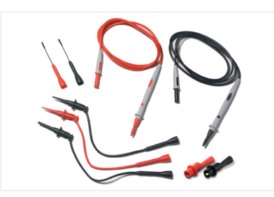
U8202A Electronic Test Lead Kit (for DMM function)