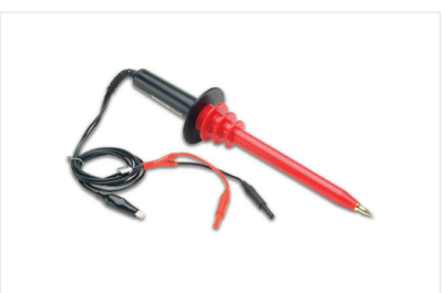
34136A 40 kV high-voltage probe (for DMM function)