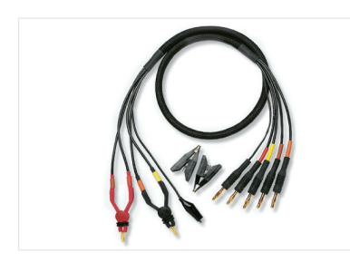
11059A Kelvin Probe Set and 11062A Kelvin Clip Set (for DMM function)