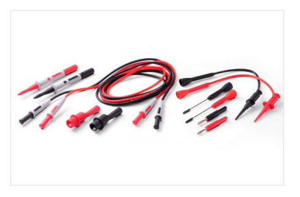
U8201A Combo Test Lead Kit