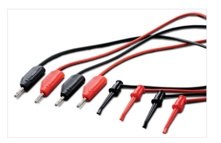
E3600A-100 Test Lead Kit (for DC power supply function)