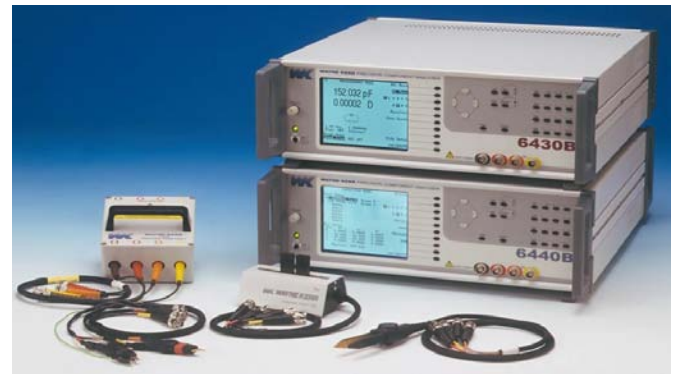
Accurate component analysis to 500 kHz (6430B) or 3 MHz (6440B) is simplified by many accessories which includes Overload Protection Unit 1J1100

The protection unit will protect the test equipment from up to 25 Joules of charged energy.