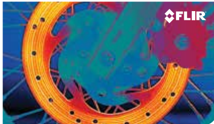
Motorcycle break testing