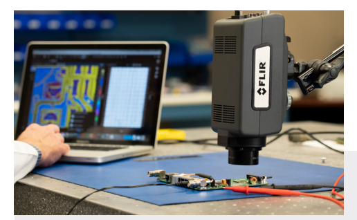
GET UP AND RUNNING QUICKLY Start testing quickly with limited rampup time and simple connections