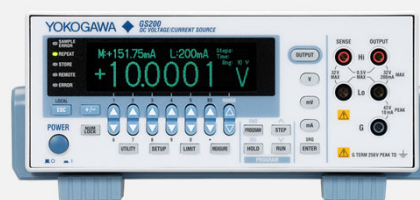
Fig.1 The highly stable GS200's outstanding Low-noise performance delivers extremely low noise DC signals used in a wide range of design processes.

To fine-tune the magnetic field, which is an inevitable requirement for initializing a quantum computer, a nanometer-size wire in the proximity of the superconducting loop is used to produce magnetic field and consequently tune the qubit energies. To generate the stable and small current a GS200 DC voltage and current source is used that offers an extremely low noise floor.