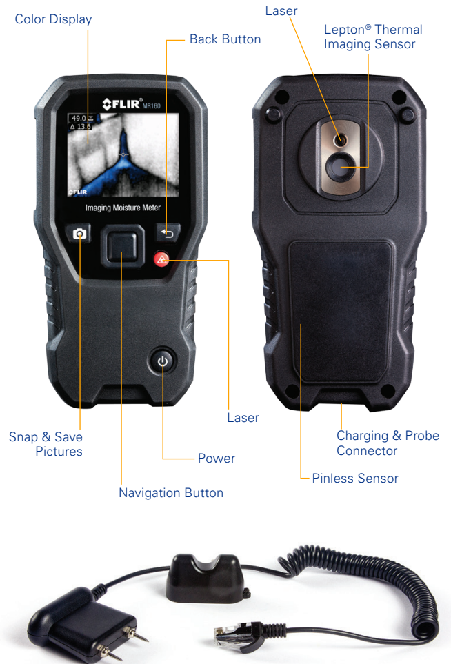
MR02 Pin Probe included

PORTLAND Corporate Headquarters FLIR Systems, Inc. 27700 SW Parkway Ave. Wilsonville, OR 97070 USA PH: +1 503.498.3547