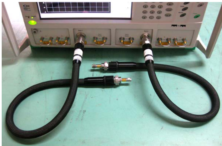
Figure 4. Phase and level stable cables used for Vector Network Analyzer (VNA) test port connections.