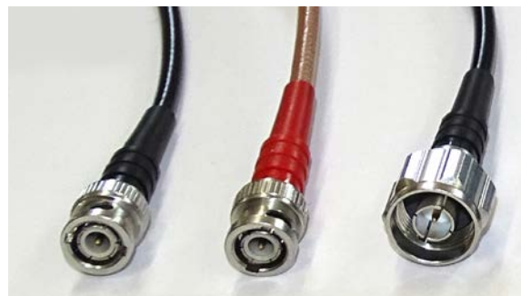
Figure 2. General purpose coaxial cables.

are typically used with higher grade cables in oscilloscope calibration. The majority of oscilloscopes appearing in the calibration workload have BNC connectors, so use of a BNC connector is unavoidable.