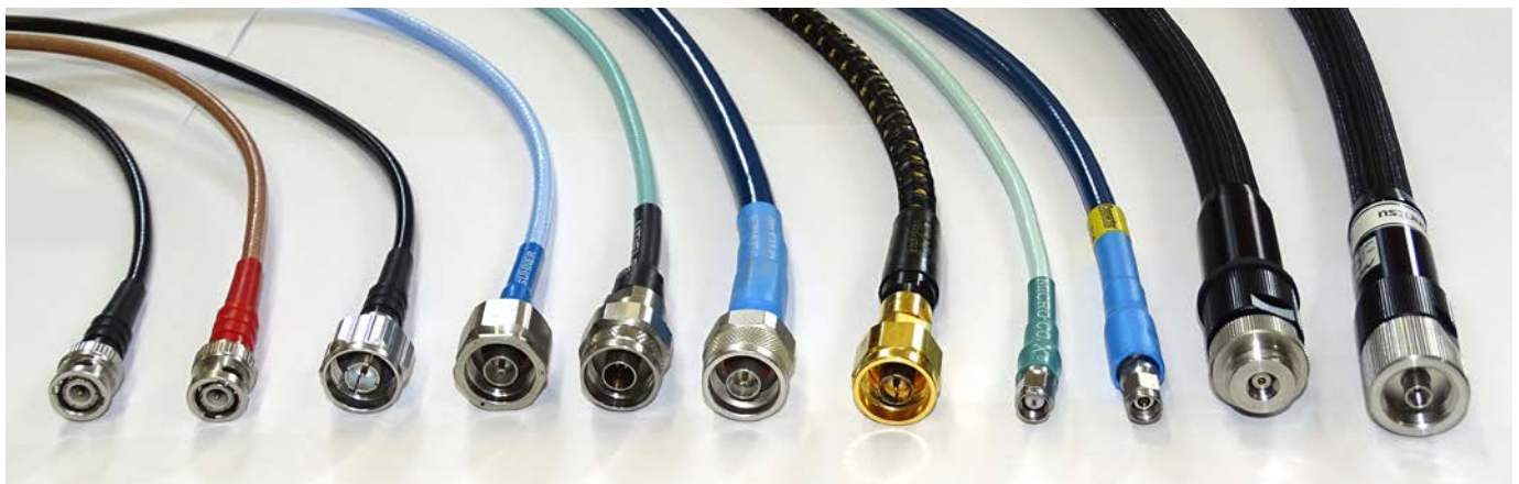
Figure 1. Typical cables and connectors: general purpose BNC and N-Type on the left; flexible and semi-flexible precision metrology grade in the middle; and phase-stable VNA testport cables on the far right.

Coaxial cables are common throughout RF and microwave calibration, representing significant investment as precision cables can be very expensive. Choosing an appropriate cable type is often critical to successfully making accurate, repeatable measurements.