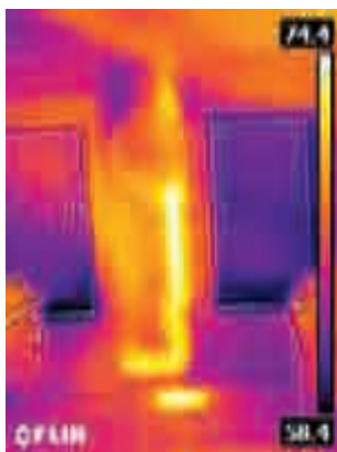
Warm drain pipe in wall