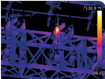
Overheating substation circuit breaker