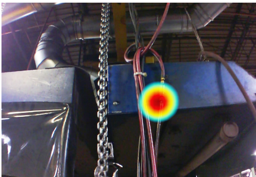
Images taken with the ii900 Sonic Industrial Imager in an industrial environment.

Fluke. Keeping your world up and running.®